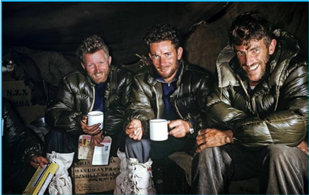
Charles Evans on the left and Edmund Hilary on the right.